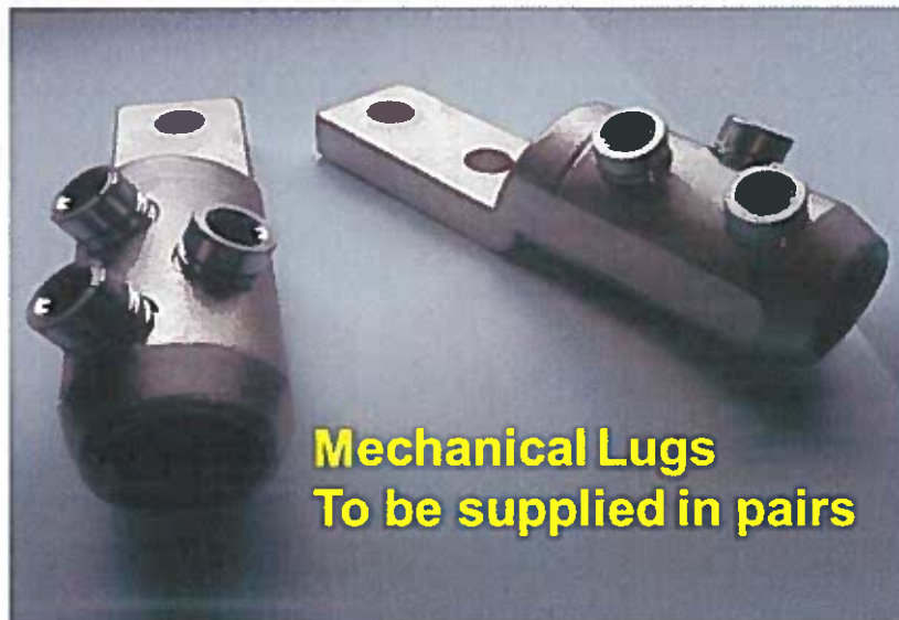
Fig 1(ii): Mechanical Lugs

The dimensions of the mechanical lugs shall be as detailed below